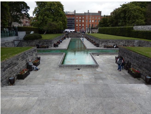
View NE towards main entranceway from Children of Lir monument.