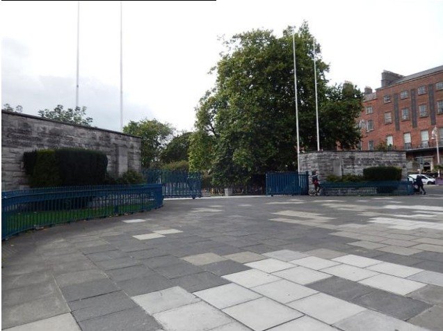
View of entrance to Garden of Remembrance from Parnell Square.