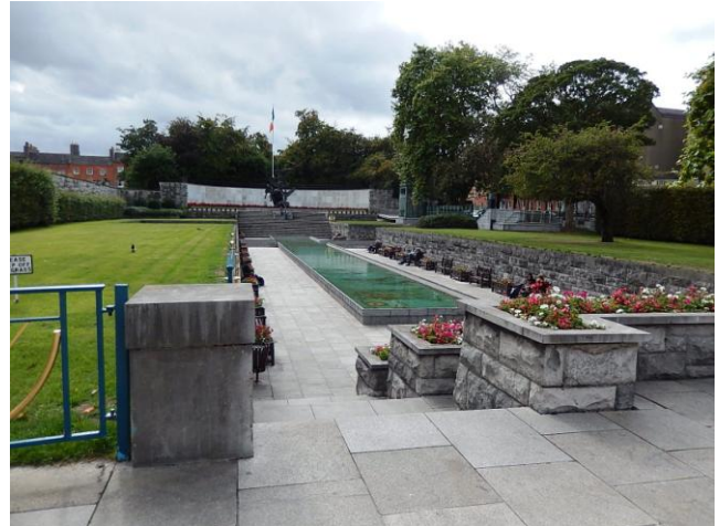
View SW of Garden of Remembrance towards the Children of Lir monument.