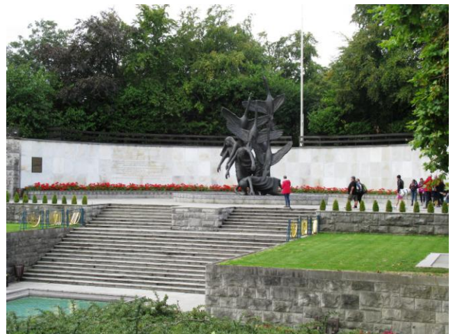
View of Children of Lir monument.