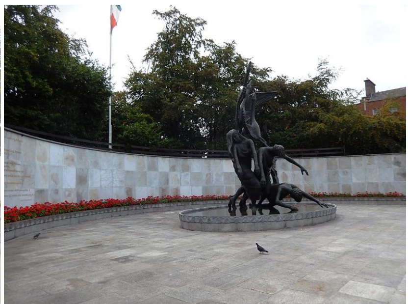
Views of Oisín Kelly's Children of Lir monument.